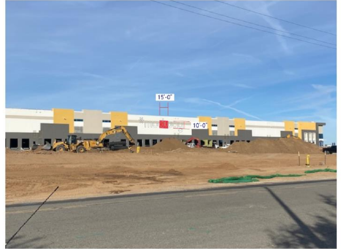
CURRENT CONDITION (EAST ELEVATION) 150 SQ.FT.