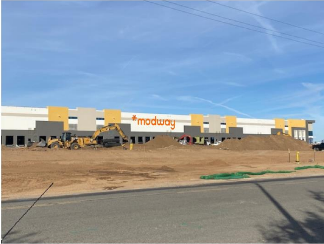
CURRENT CONDITION (EAST ELEVATION) PROPOSED SIGN 1499.7 SQ.FT.