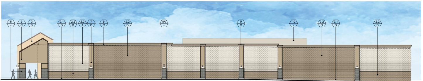
1 PROPOSED EAST ELEVATION (SIDE)