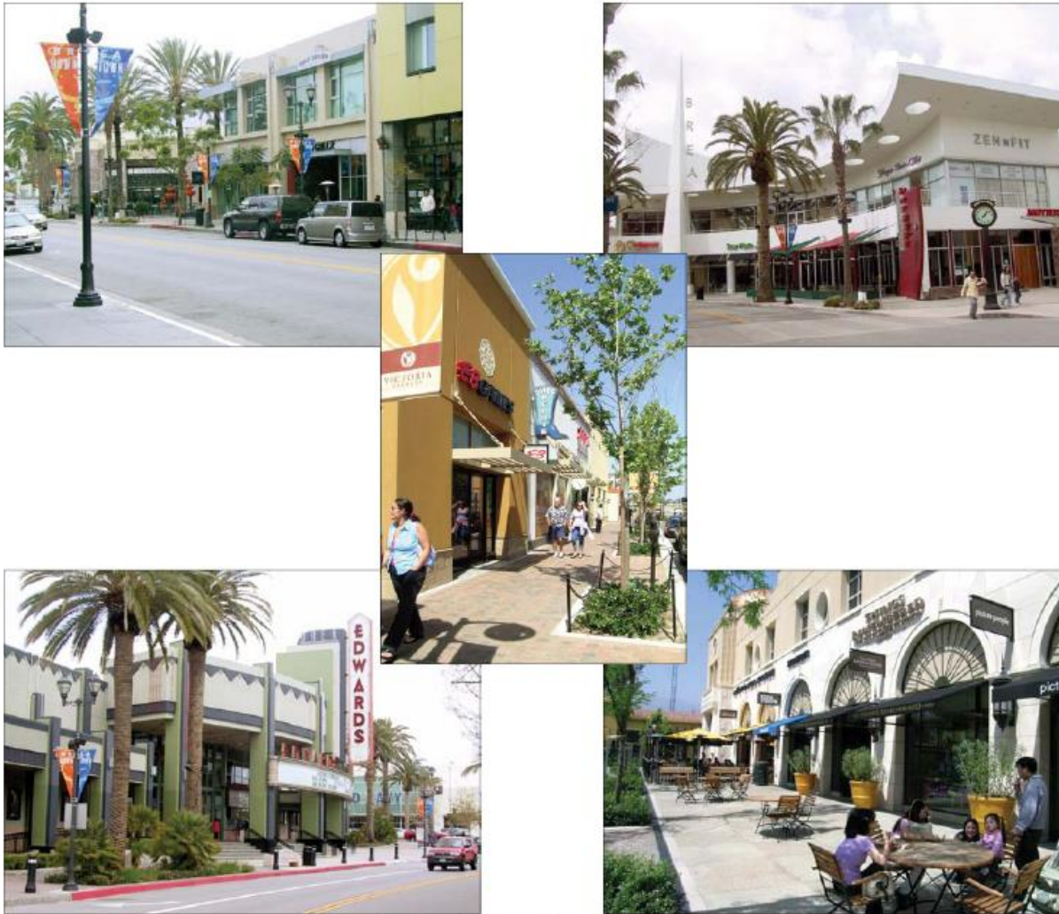
Examples of Pedestrian-oriented commercial uses.

This section describes the permitted, conditionally permitted and prohibited uses, as well as development standards for the Pedestrian Commercial zone.