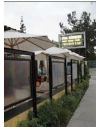
A dining patio on private property adjacent to the sidewalk is demarcated with metal fencing. Plantings and temporary sun umbrellas are used.