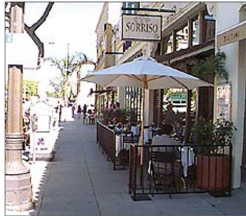
Removable metal fencing is used to demarcate the dining space. Planters and temporary sun umbrellas create an attractive environment.