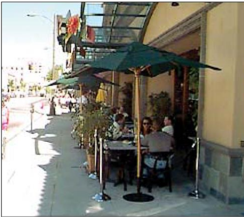
Removable bollards demarcate the dining space. Potted plants and temporary sun umbrellas are used to create a pleasant ambience.