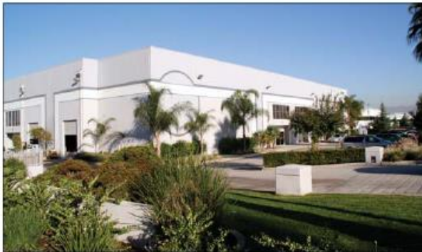
Examples of appropriate developments in the Commercial/Industrial Business Park zone.

Main Street/Interstate-15 District and Highway 395/Interstate-15 District provide enhanced vehicular, truck and rail accessibility by taking advantage of their location along the Interstate-15 corridor with its connection to Highway 395, and its linkage to the Southern California Logistics Airport (SCLA). In the Industrial District, along I Avenue, this zone serves as a transition from residential and other commercial uses.