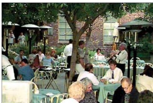
A private outdoor dining patio is created facing the alley. Trees, planters and temporary sun umbrellas are used to create a pleasant ambience.