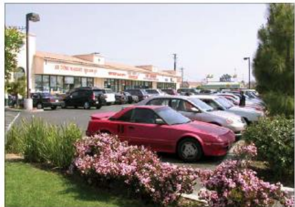
Examples of appropriate Neighborhood Commercial uses