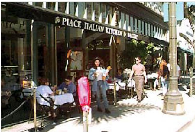
Removable bollards demarcate the dining space. Shade is provided by the retractable canopy overhead.