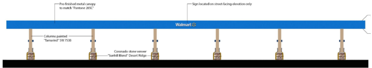
Canopy Front Elevation (North)